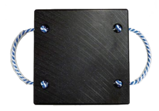
Widths 12" to 48" Available