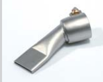
Wide slot nozzle 20 mm Article No: 107.142