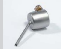
Soldering nozzle Ø 2 mm Article No: 107.146