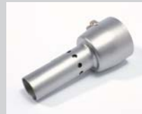
De-horning nozzle Article No: 107.007