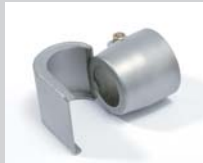
Spoon reflector 25 x 30 mm Article No: 107.313