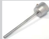
Extension nozzle Ø 5 x 130 mm, straight Article No: 107.006