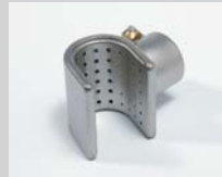
Sieve reflector 20 x 35 mm Article No: 107.310