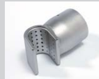
Sieve reflector 35 x 20 mm Article No: 107.309