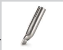
Tacking nozzle * Article No: 106.996