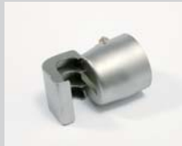
Soldering reflector 17 x 34 mm Article No: 107.325