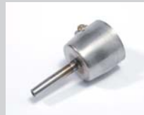
Tubular nozzle Ø 5 mm Article No: 107.154