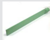
Swordshaped nozzle 74 x 12 x 520 mm, edges rounded, PTFE coated Article No: 107.347