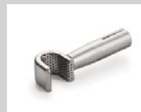
Sieve reflector (Ø 8.25 mm) *, 10 x 12 mm Article No: 107.324

* use in combination with Ø 5 mm: 107.144 105.567 107.154 107.006