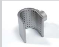
Sieve reflector 50 x 35 mm Article No: 107.311