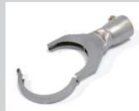
Folding reflector 70 x 12 mm Article No: 107.315