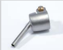
Soldering nozzle Ø 4 mm Article No: 107.151