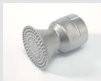
Sieve reflector Ø 65 mm Article No: 106.127