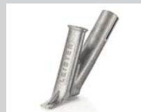
Speed welding nozzle *, triangular shaped, 5.7 mm 7 mm Article No: 106.992 106.993