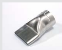
Wide slot nozzle 70 x 10 mm Article No: 107.258