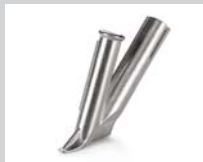
Speed welding nozzle * Ø: 3 mm 4 mm 5 mm Art. No. 106.989 106.990 106.991