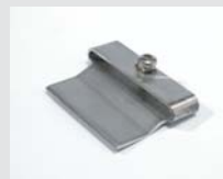
Scraper nozzle, only with heater tube, Article-No: 116.053 Article No: 116.054