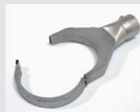
Folding reflector 125 x 22 mm Article No: 107.330