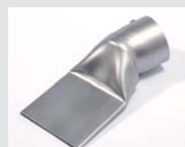
Wide slot nozzle 75 x 2 mm, delivered with stand, Article-No: 116.753 Article No: 107.266