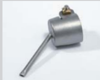
Soldering nozzle Ø 3 x 1.5 mm, oval Article No: 107.148