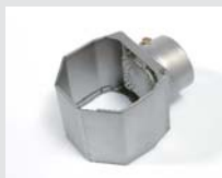
Folding reflector 60 x 75 mm Article No: 107.328