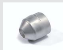
Round nozzle 20 mm Article No: 107.229