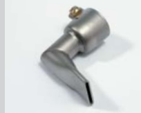
Angled nozzle 20 mm, 90° angled Article No: 105.556