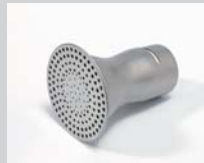
Sieve reflector Ø 65 mm Article No: 107.319