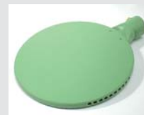
Welding mirror 270 mm, PTFE coated Article No: 107.346