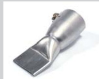
Wide slot nozzle 40 mm Article No: 106.999