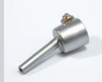
Tubular nozzle Ø 5 mm Article No: 107.144