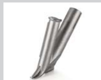
Speed welding nozzle *, with small air-slide, Ø: 3 mm 4 mm 5 mm Art. No.: 105.43 1105.432 105.433