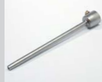
Extension nozzle Ø 5 x 150 mm, straight Article No: 105.567