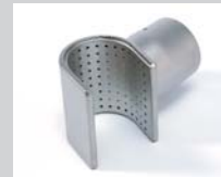
Sieve reflector 50 x 35 mm Article No: 107.308