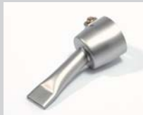
Wide slot nozzle 20 mm Article No: 106.998