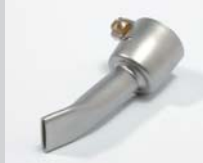
Wide slot nozzle 15 mm Article No: 107.141