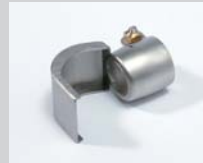
Spoon reflector 25 x 30 mm Article No: 107.312