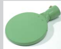
Welding mirror 135 mm, PTFE coated Article No: 107.345