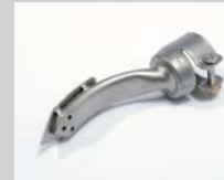
Ironing nozzle 15 x 25 mm Article No: 107.305