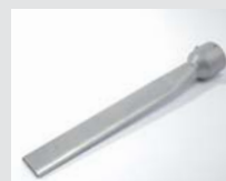
Wide slot nozzle 45 x 12 x 350 mm Article No: 105.961