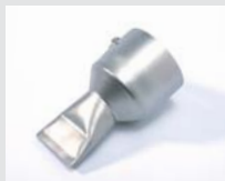
Tape welding nozzle 40 mm Article No: 107.134