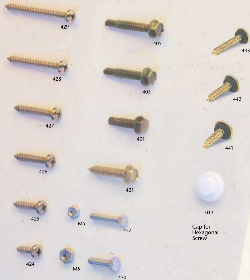
Cap for Hexagonal Screw

* Self drilling screw: Specially coated for condensation environments. suitable for greenhouse and swimming pool coverings